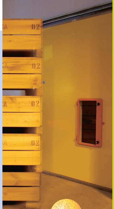
SEEKA PACK PLAN Packing is currently 1m trays ahead of schedule